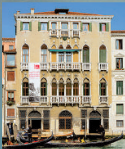
The Palazzo Michiel